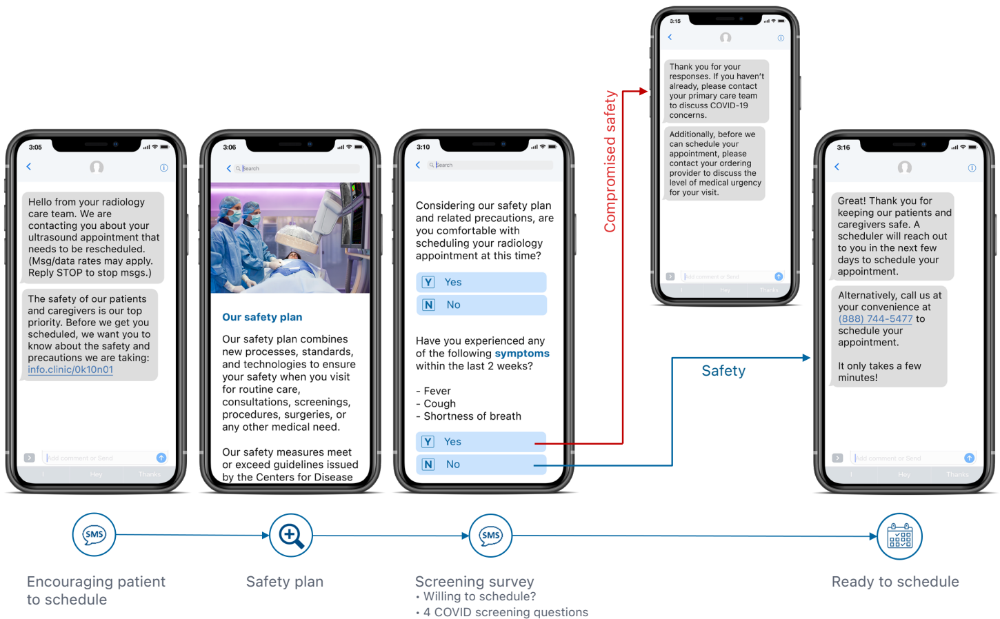
A sample from one of Patient Engagement Manager's messaging flows